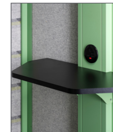
SHELVES Integrated 25mm MFC shelves can be mounted to posts and panels