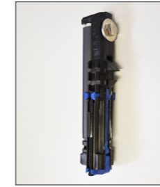
SLOW CLOSE Add to sliding doors for a gentle slow close