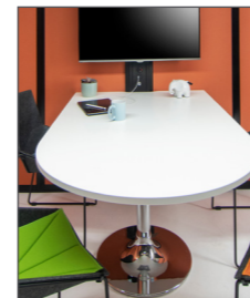
DESKTOP Integrated 25mm MFC desktops can be mounted to posts and panels