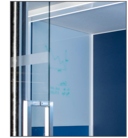
WRITEABLE MAGNETIC GLASS Hang magnetic writeable glass inside pods