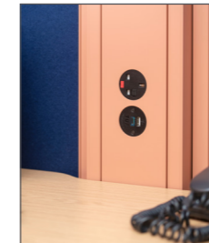
POWER 2 GANG Flush mount power and data modules can be added to new or existing posts