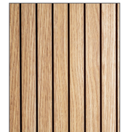
CLADDING 18mm MFC exterior cladding available in multiple finishes (straight walls only)