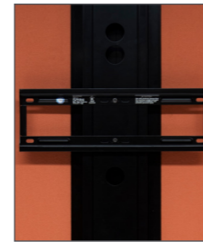
TV BRACKETS Add TV brackets to existing or new posts