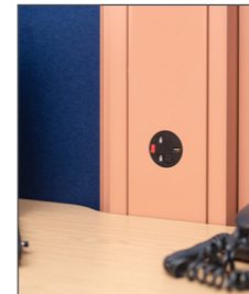
POWER 1 GANG Flush mount power and data modules can be added to new or existing posts