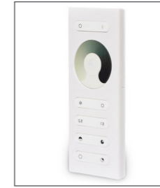
REMOTE CONTROL Dimmable remote controlled lighting