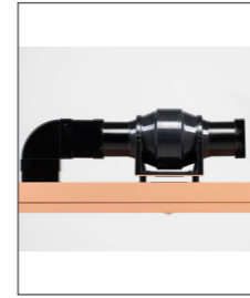
AIR CIRCULATION Add to any Hoozone pod. Concealed fans supplied in phone booths