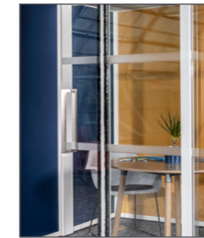
MANIFESTATIONS Stripes and bespoke manifestations available on glazed panels