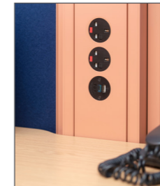
POWER 3 GANG Flush mount power and data modules can be added to new or existing posts