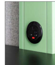
PIP UNIT Pip power modules can be added to posts or desktops