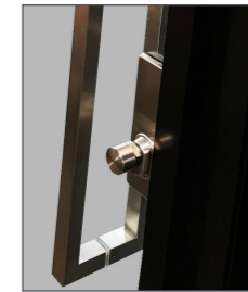
DOOR LOCK Sliding door lock available