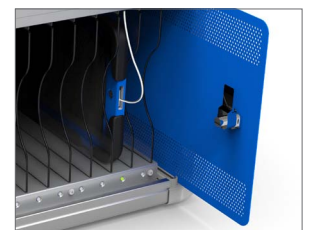
Retractable metal door