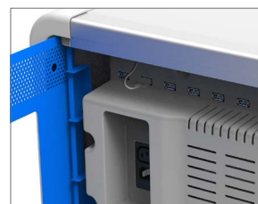
Mains power lead plugged in at the back