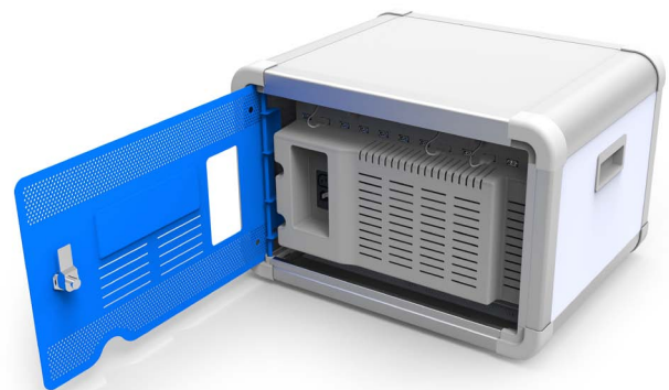
DeskCabby Back Open