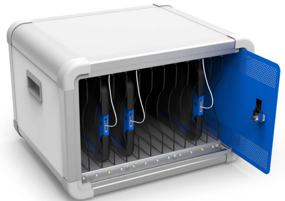
DeskCabby Front Open

* Compatible with devices charged by USB only.