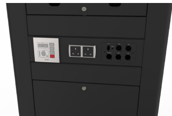
Cut out for control panel/power/input plate