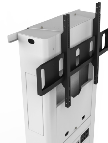
VESA mounting bracket included