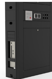
Compact or tower pc compatible