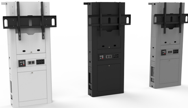
Totem finished in standard black with custom white and silver powdercoat